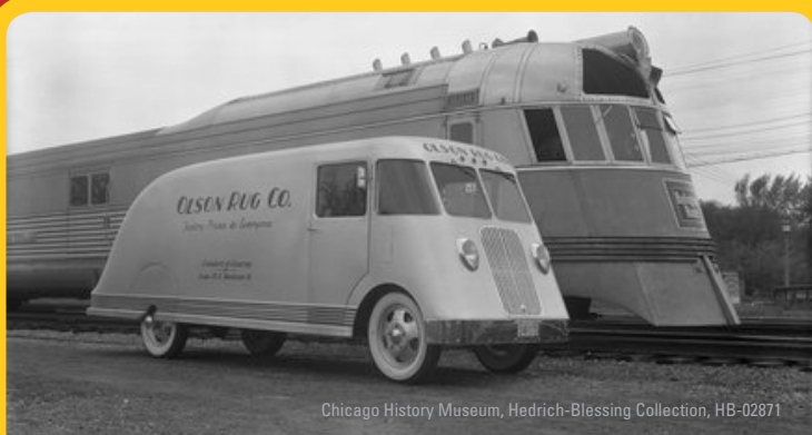
Chicago History Museum, Hedrich-Blessing Collection, HB-02871