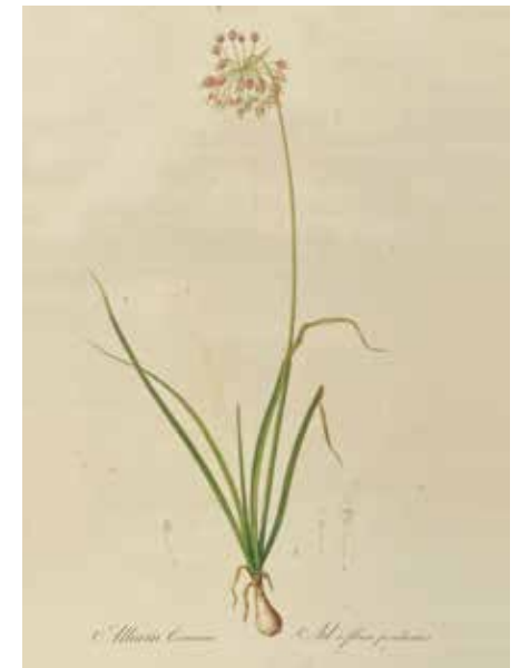
Left: Allium Cernum plant at Jaffee History Trail, Right