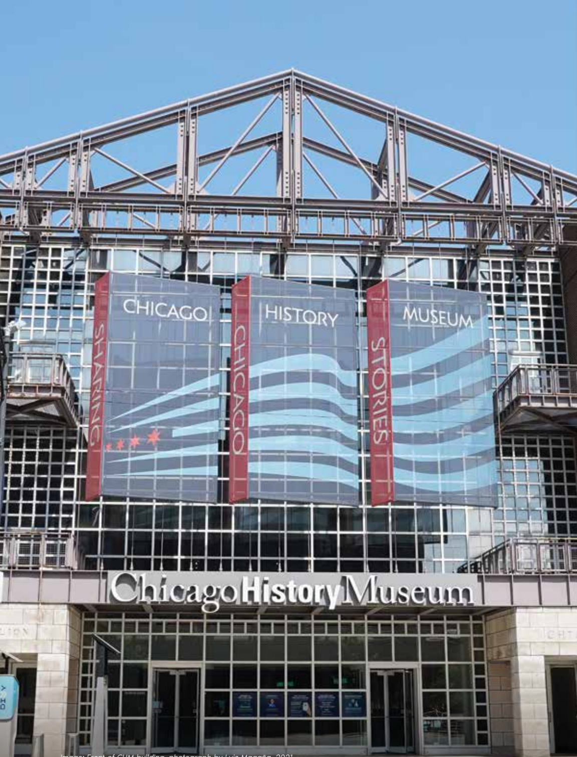
Image: Front of CHM building