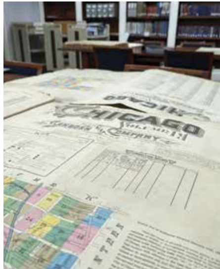
Top: The Stacks at the Chicago History Museum, 2023. Bottom: The Sanborn Maps in the Abakanowicz Research Center, 2023.