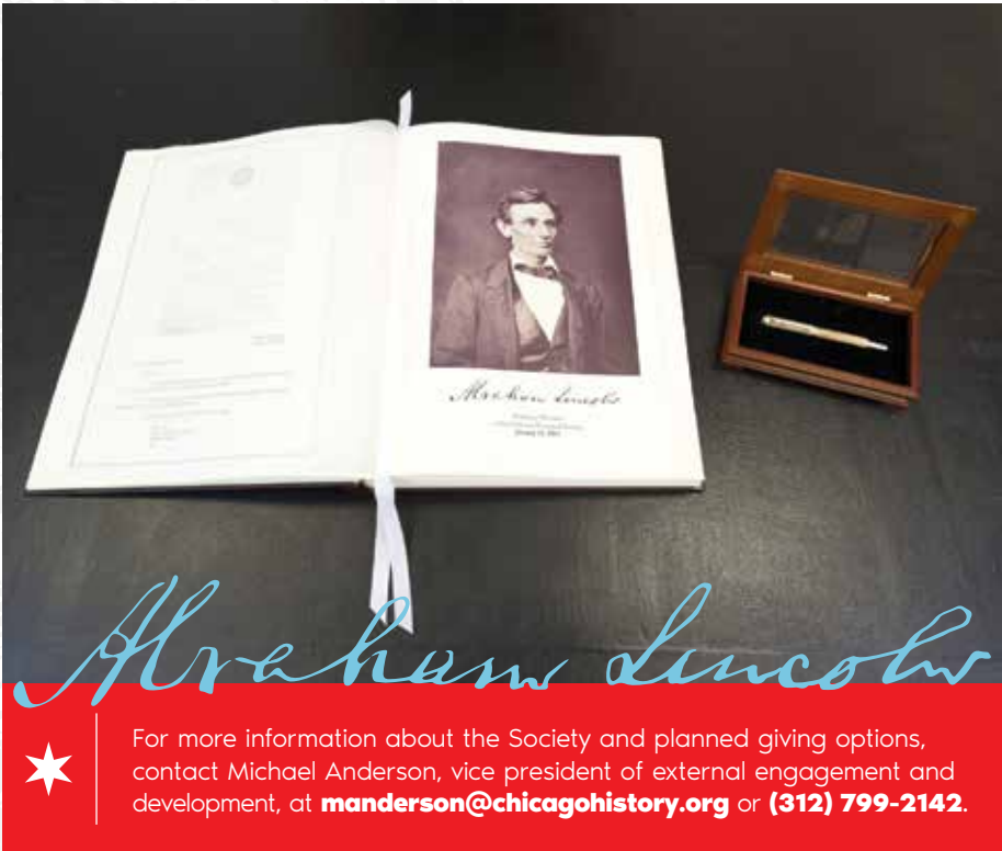
Top: Abraham Lincoln White House Desk at Chicago History Museum. CHM Photograph, 2024. Bottom: Lincoln Honor Roll Society commemorative book and signing pen. CHM Photograph, 2024.