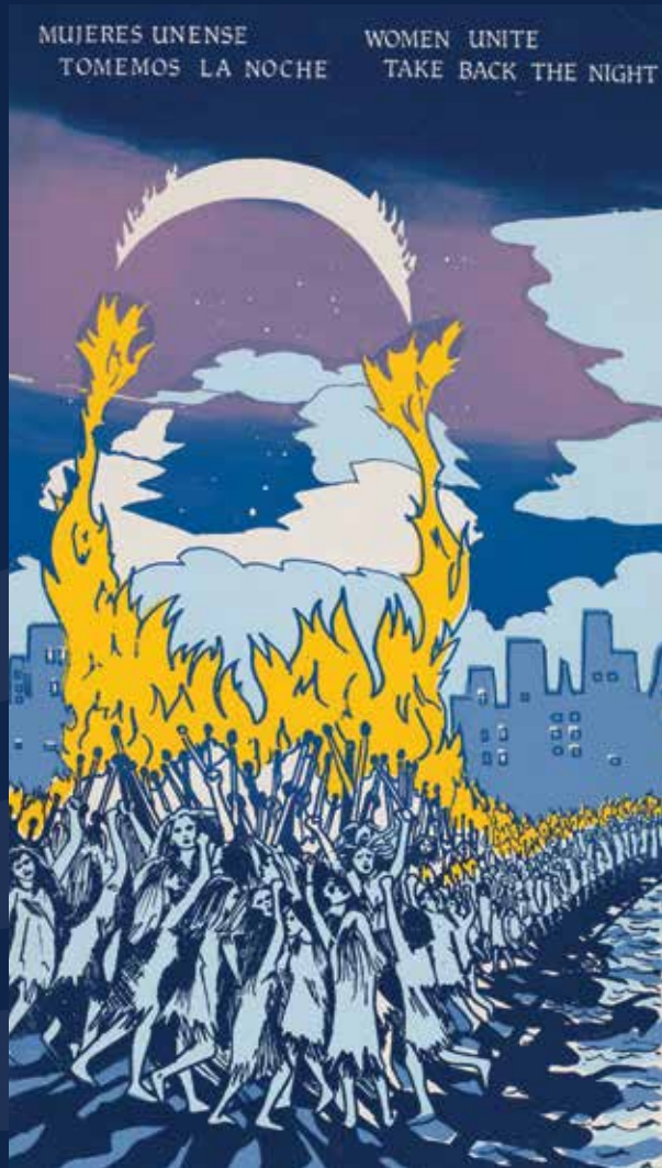
Left: Liberation School for Women poster, Chicago Women’s Liberation Union, c. 1972. CHM ICHI-183503. Right: Women Unite Take Back the Night poster. CHM ICHI-183506.