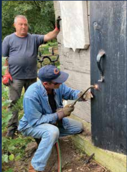
Top: Openlands volunteers joined by US Congressman Mike Quigley plant trees at the Richard M. and Shirley H. Jaffee History Trail. Bottom: Chicago Park District metal workers repair a steel door on the Ira Couch tomb.

Park District workers' first project was to replace and rebuild a steel entry door that secures the original stone door to the tomb. Preservation consultants then inspected the building to assess long-term repair needs for the 166-year-old stone structure.