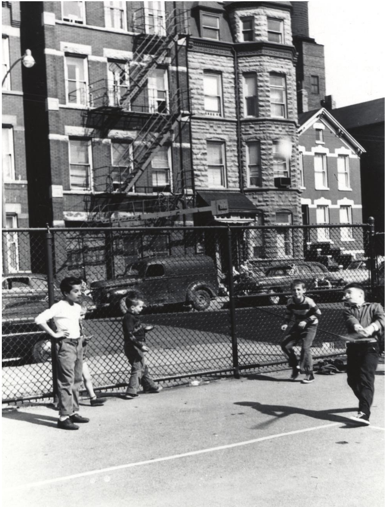
Komensky School, BHNC_0033_0233_092.jpg