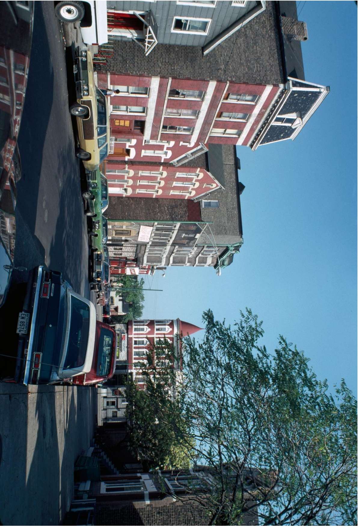
Carpenter and 18th Street, Pilsen