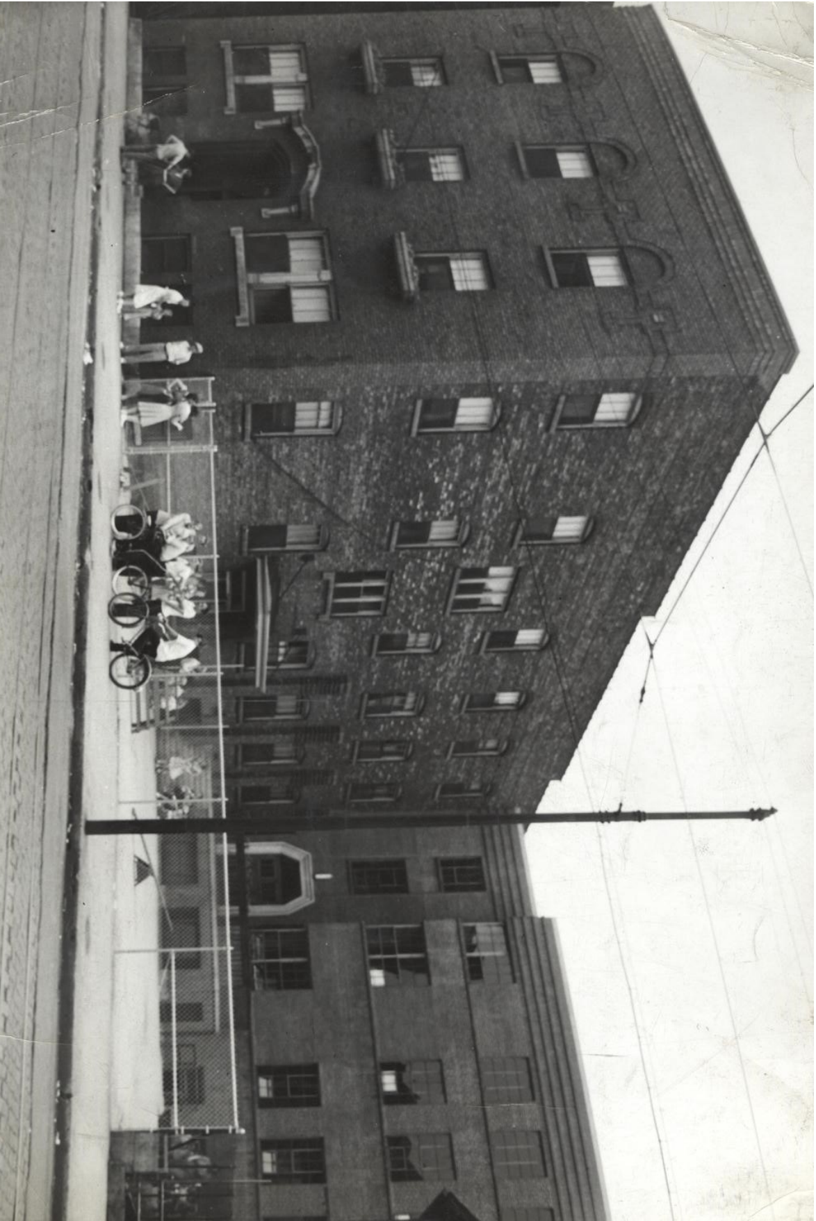
Teenagers gathering outside of Howell House