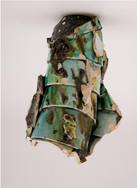
Melted Teacups ICHI-64480