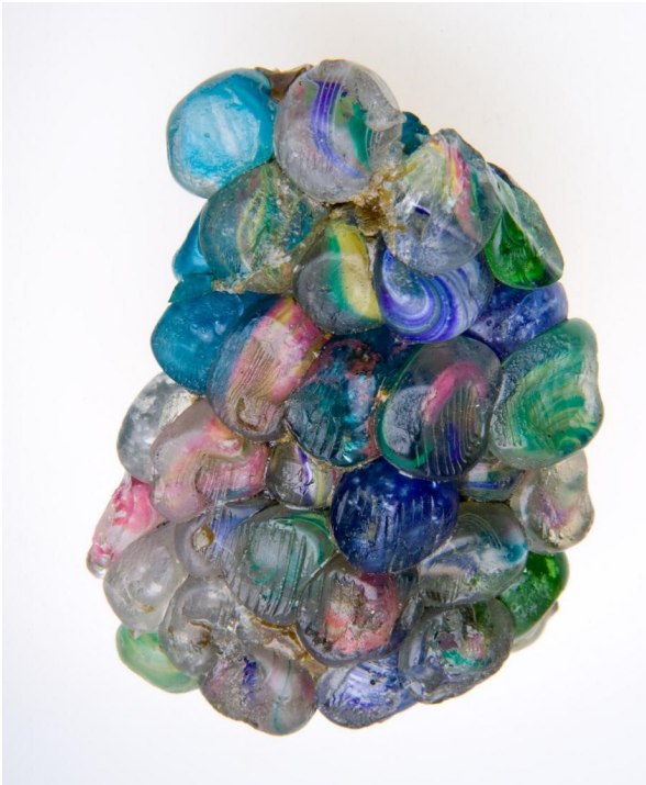
Melted Marbles ICHI-64557