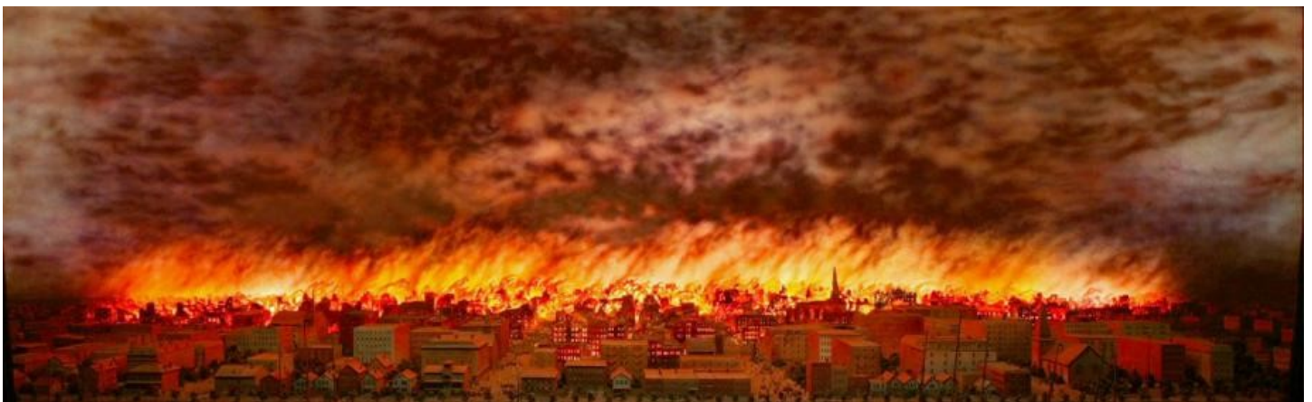
Chicago Fire Diorama in Imaging Chicago: An American City at the Chicago History Museum