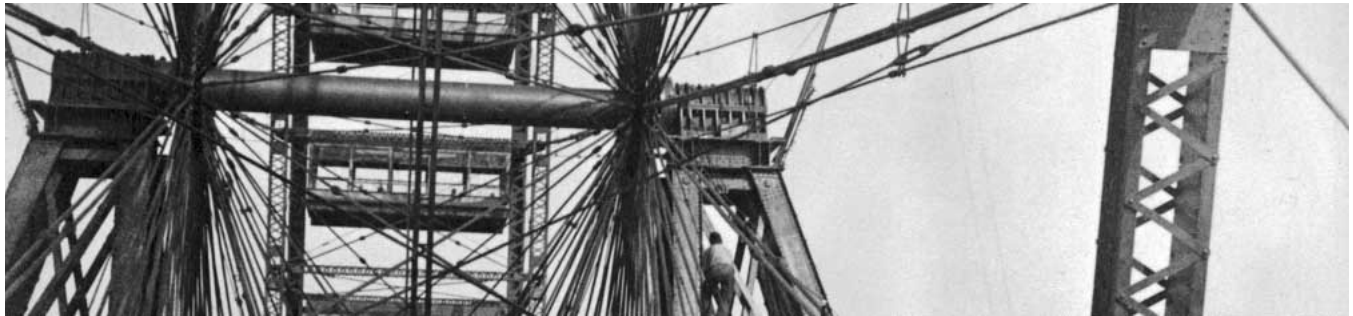
Framework of the first Ferris wheel