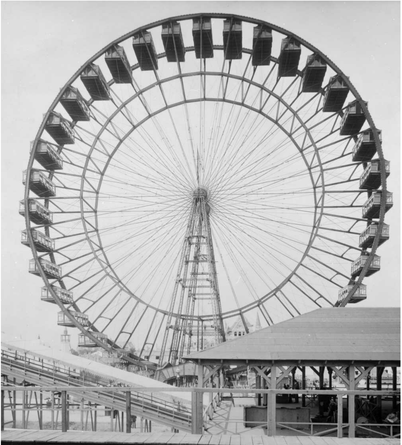
Chicago Historical Society, ICHi-25054