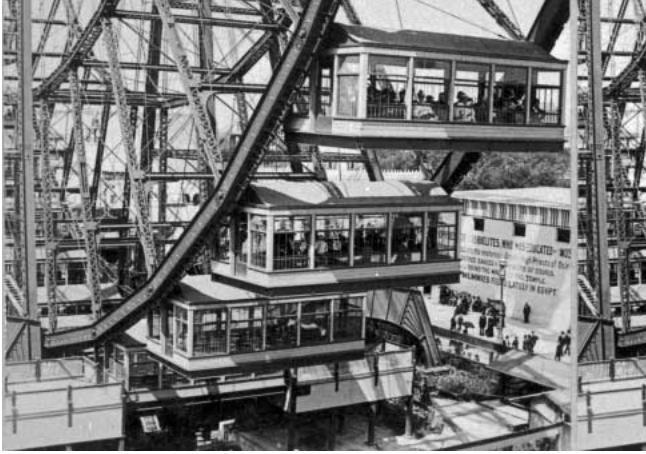
Passengers aboard the first Ferris wheel