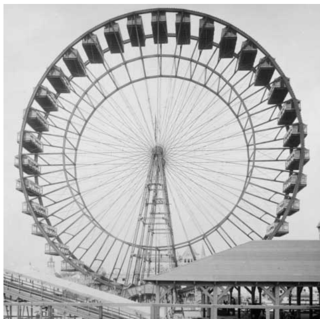
The first Ferris wheel

On June 21, 1893, the Ferris wheel had its first riders: George Ferris, his wife, and invited guests, including the entire City Council and a forty-piece band. From that day on, the Ferris wheel ran every day from 8:00 A.M. until 11:00 P.M.