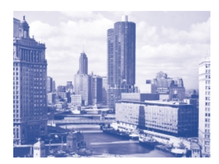
Chicago River today

Quite a lot has happened to me since the days before Fort Dearborn. Today I look more like this: