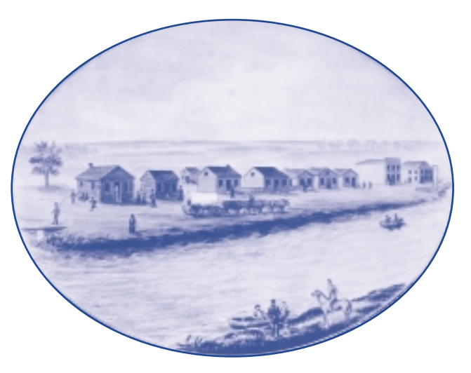
South Water Street

so they built a fort on my banks. 2 What was the name of this fort? 3 Do you think a lot of people lived here along my banks? In the early 1800s, my banks looked like this: