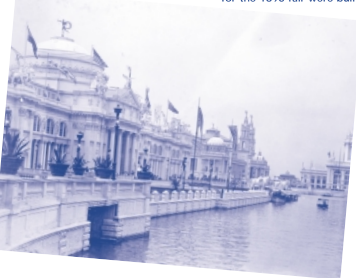
A completed building for the World's Columbian Exposition