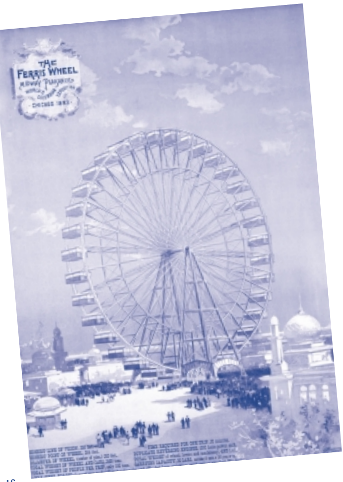
Poster advertising the Ferris Wheel

1 What rides have you been on? What rides would you like to go on?