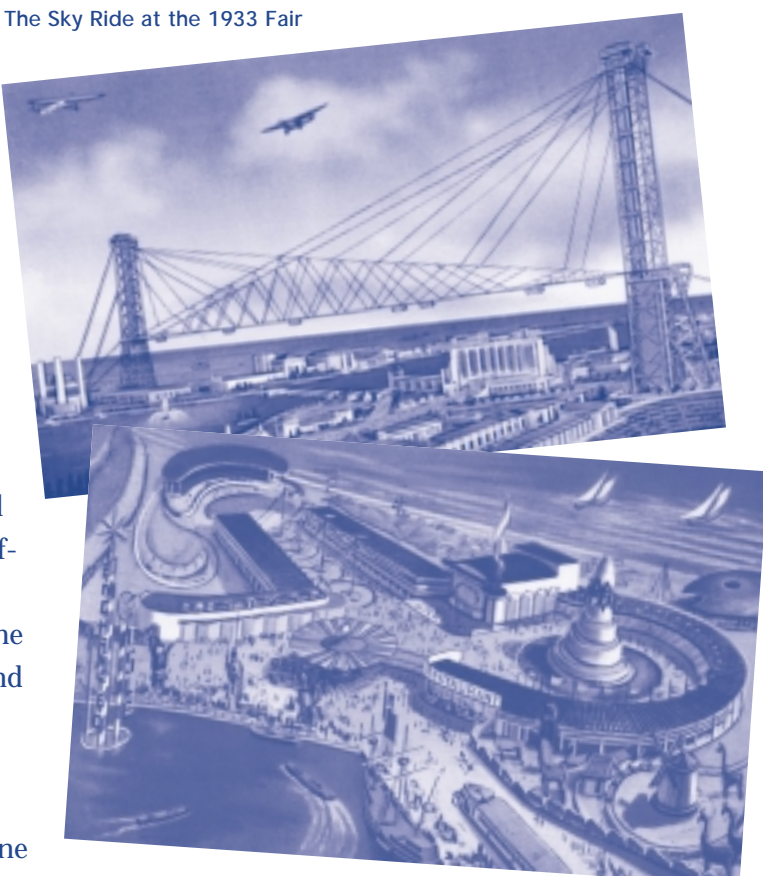
Enchanted Island at the 1933 Fair

I had two favorite things at the fair. One was the Enchanted Island that was made just for kids. It had a place where you could watch bears drink milk, a pony track, a