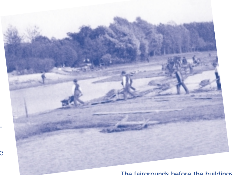
The fairgrounds before the buildings for the 1893 fair were built

Because I have only been to a carnival, I asked Grandpa what makes a world's fair a world's fair. He told me that there are exhibits about all sorts of things and about all sorts of people from around the world. He said that it took two years to make all the buildings for the exhibits. The buildings were not made from bricks and iron, but out of a kind of plaster called staff. All the buildings were painted white, so the fair was given the nickname the White City. He said the