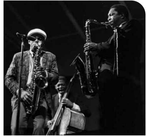
John Coltrane performs in Chicago, August 1965.