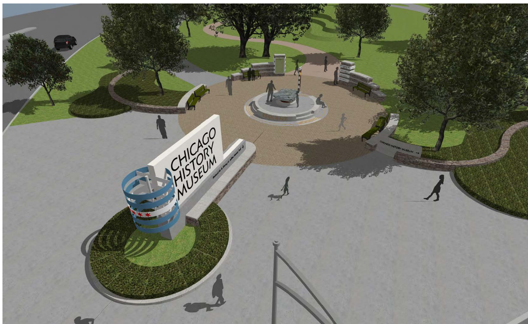
Illustration of the Northwest entry plaza of the Richard M. and Shirley H. Jaffee History Trail.

A special thank you to those who have supported the This Is Chicago campaign.