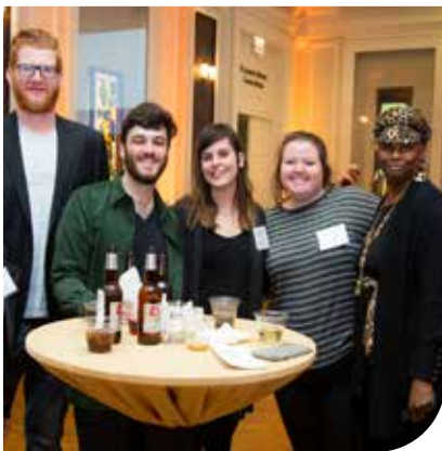
CHM volunteers and staff enjoying the annual Volunteer Recognition Reception.

The Chicago History Museum thanks all of its volunteers.