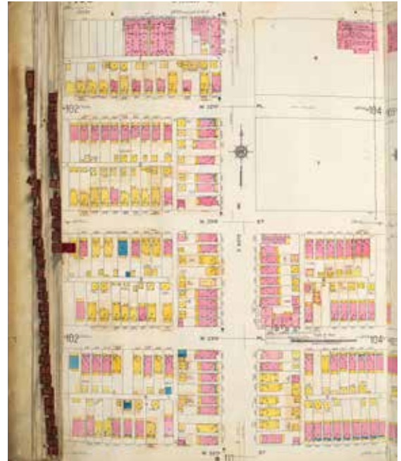
Page 103 from the Sanborn Fire Insurance Map of Chicago, Volume 20, 1918 corrected to 1949.

At this special members-only event, the CHM Research Center used Sanborn Fire Insurance maps to take a virtual walk through the past. With maps documenting specific buildings, members took a closer look at Comiskey Park in 1956, Wrigley Field in the 1920s, Riverview Park in 1950, and buildings at both world's fairs.