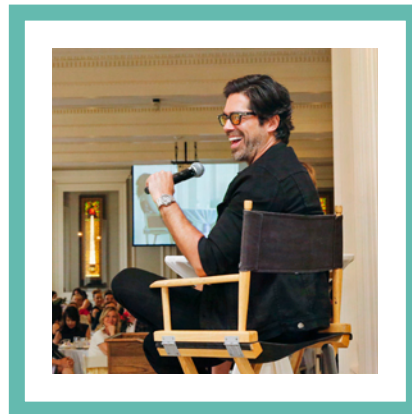
Brian Atwood captivates the crowd during the Costume Council's spring luncheon