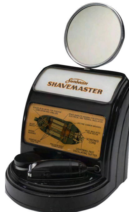
Sunbeam Shavemaster store display unit, c. 1937. CHM purchase, Anna Hasburg Fund