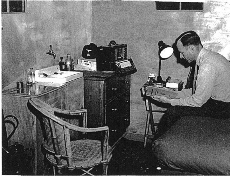
Image A - Puestow continued to hone his medical skills even while in command of the hospital and not actively participating in surgery.