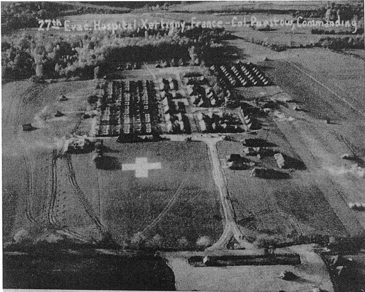
This was a most satisfactory arrangement of tents. Three ward tents end-to-end formed a ward accomodating up to 75 patients

Image D - A later version of the tent arrangement proved much more successful and contributed greatly to the efficiency of the unit.