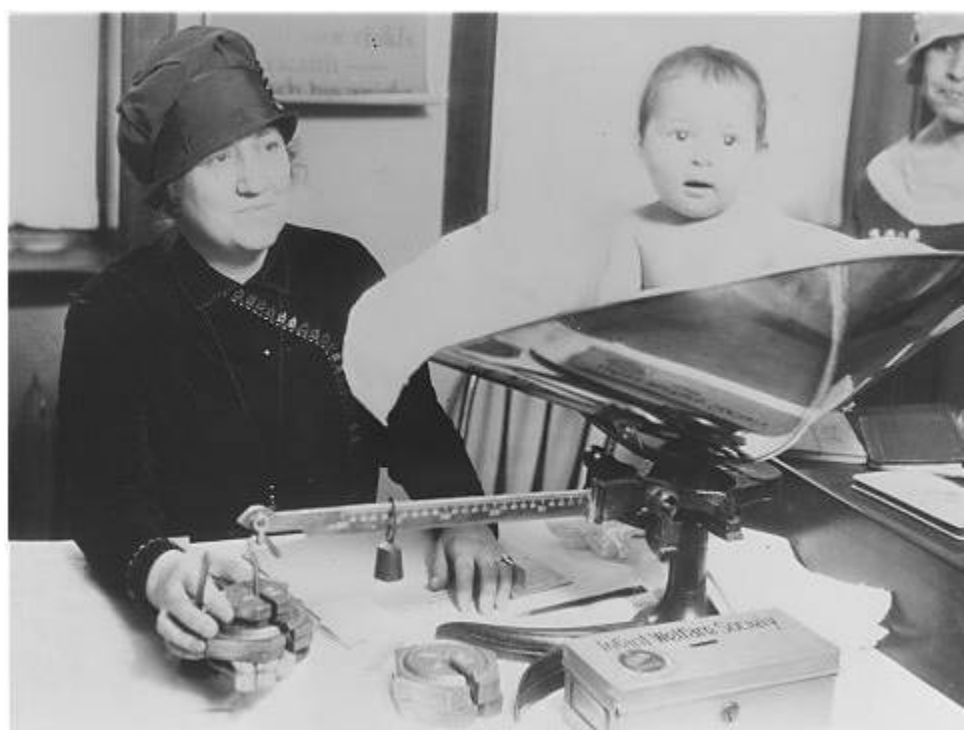
Photographer: Wallace Kirkland. University of Illinois at Chicago <a href="http://www.encyclopedia.chicagohistory.org/pages/281.html">http://www.encyclopedia.chicagohistory.org/pages/281.html</a>