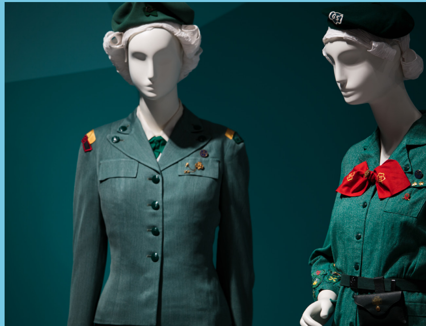
A Girl Scout intermediate uniform, 1948–63 (left), and a Girl Scout leader uniform, 1948–52, designed by Mainbocher. Gifts of the Girl Scouts of Greater Chicago and Northwest Indiana