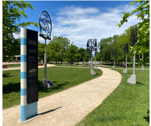
A view of the trail and kinetic sculptures, 2022.