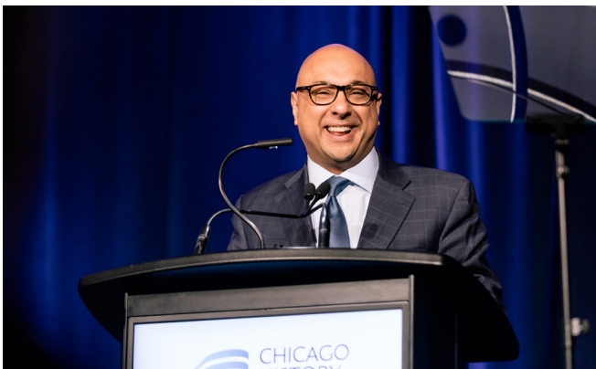
CHM board member and MSNBC host Ali Velshi served as the master of ceremonies.