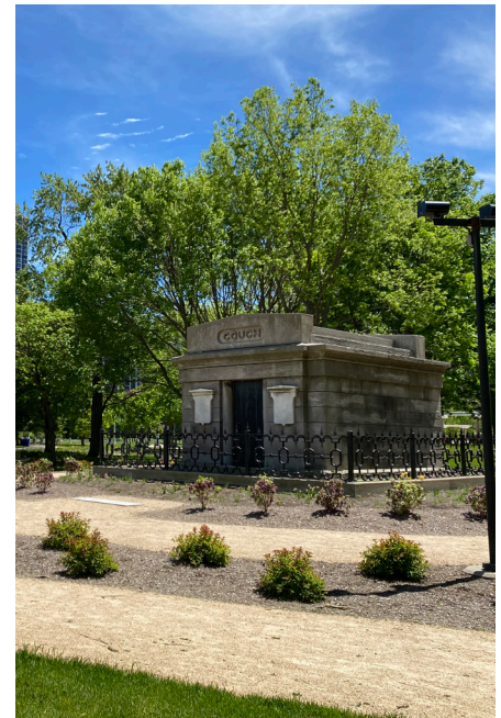
A view of the trail and the Couch Tomb, 2022.