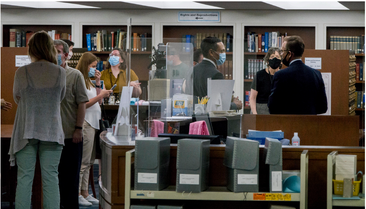
Attendees in the ARC.