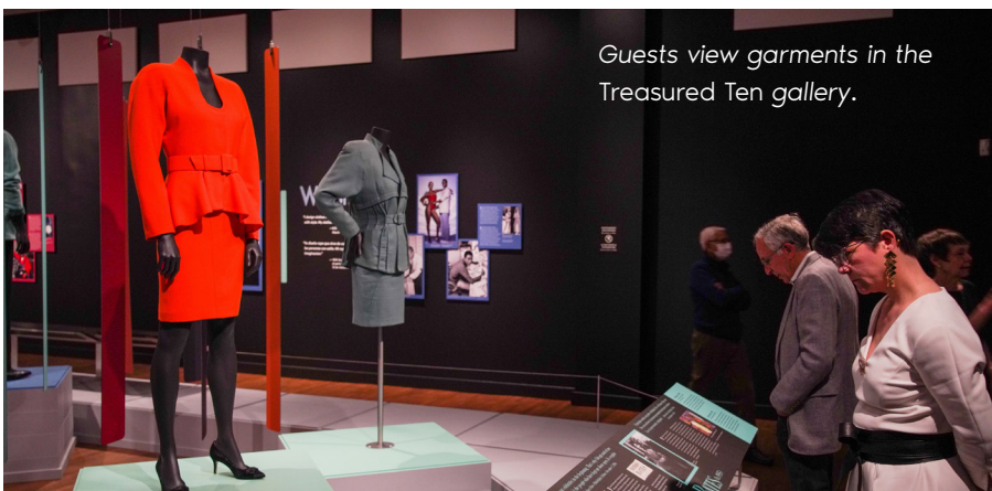
Guests view garments in the Treasured Ten gallery.