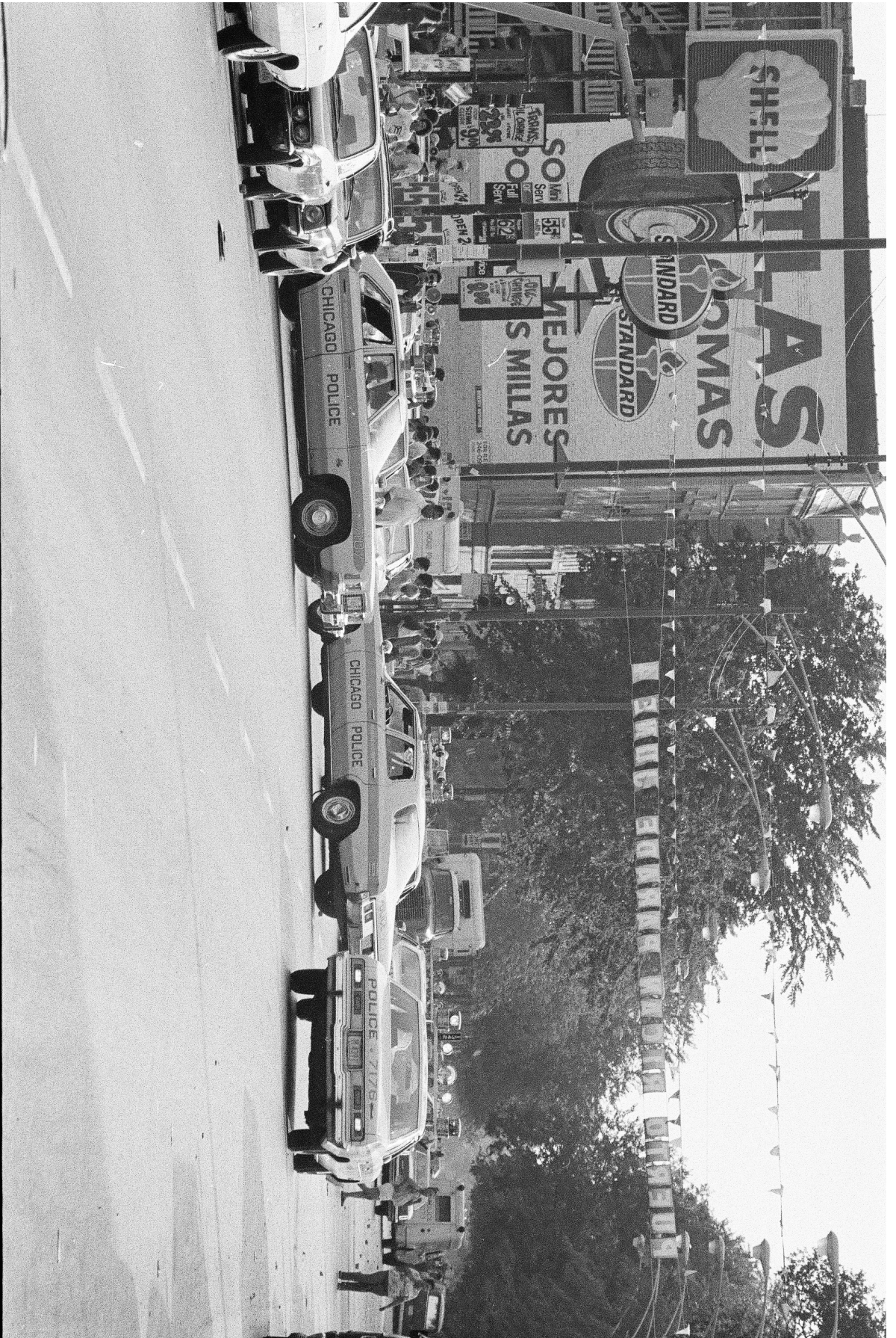
Police and rioters in Humboldt Park, Chicago, Illinois. 1977.