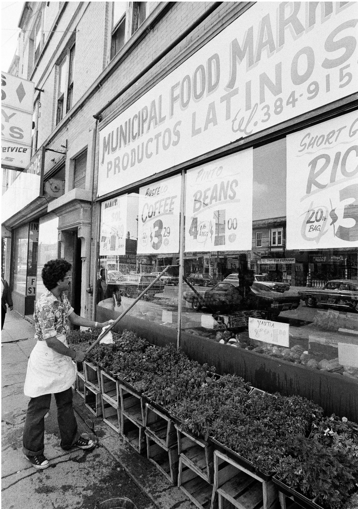
Scenes from Humboldt Park after the riot. Neighborhood residents walk the streets and take stock of the damage, Chicago, Illinois. 1977.