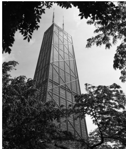
825 N. Michigan Ave, formerly the John Hancock Center . HB31216 K3