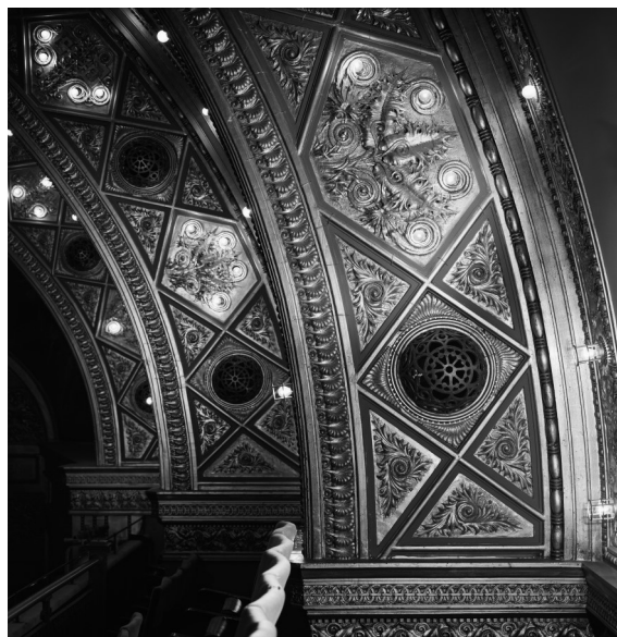
Picture captionDetail view of wall decorations inside the Auditorium Building by Adler and Sullivan. HB31105 – J