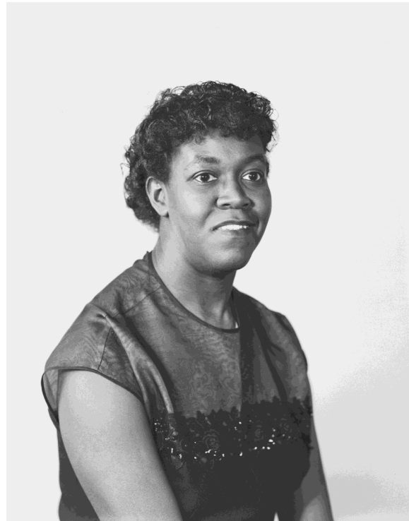
Portrait of Gwendolyn Brooks circa 1960. ICHI-059683

Note: Harold Washington was Chicago's first African American mayor when he was elected in February of 1983.